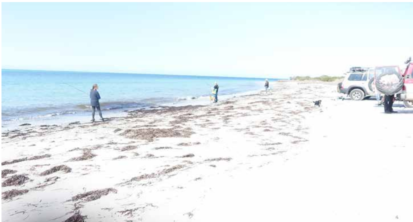
Stinky Beach was a pretty spot but sadly the fish were not in a co-operative mood that day.