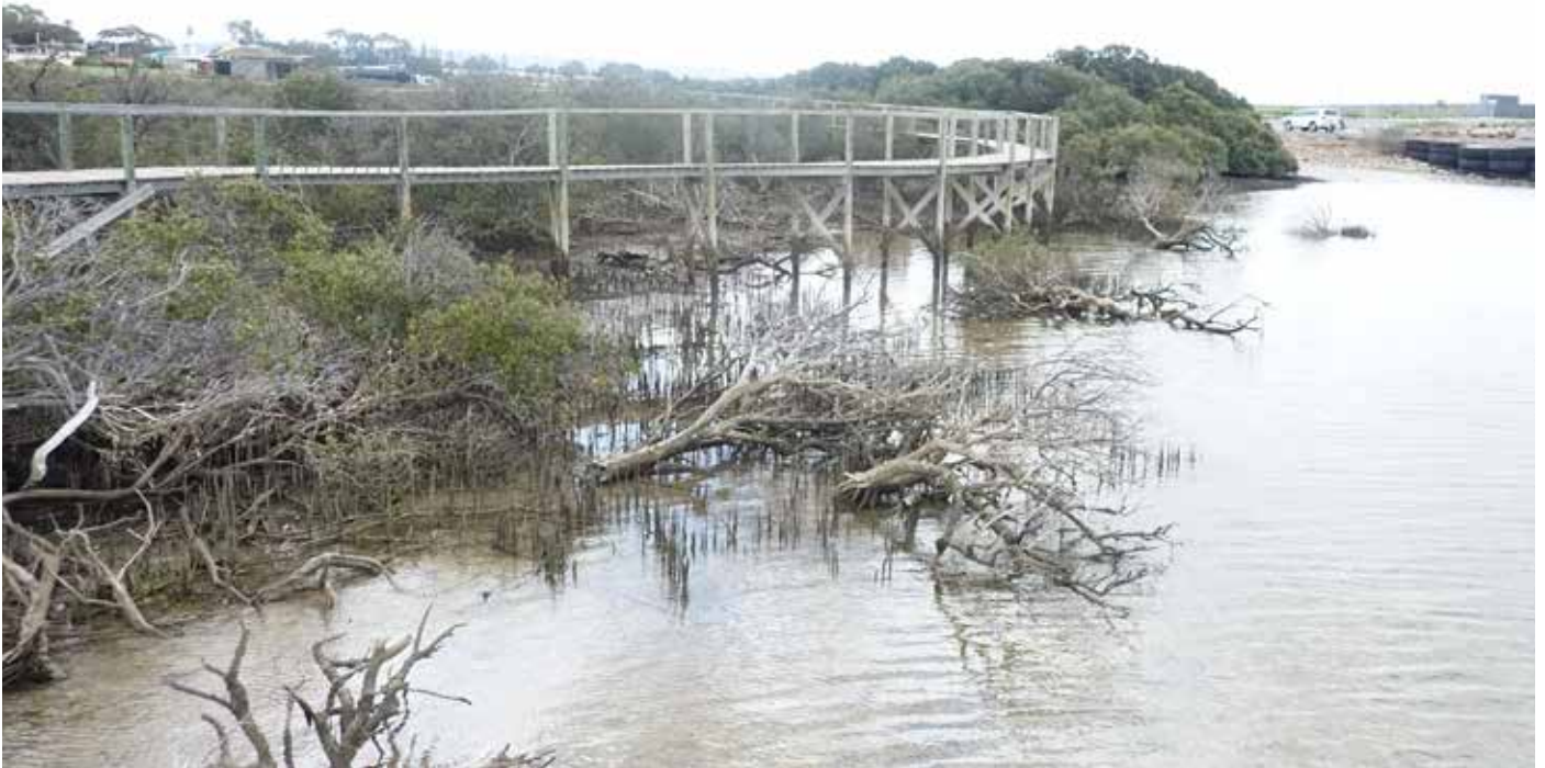
The boardwalk at Cowell over the mangroves, also known as the Franklin Harbour Jetty, is a popular fishing spot. Below, dogs enjoy the freedom as they take advantage of an empty beach