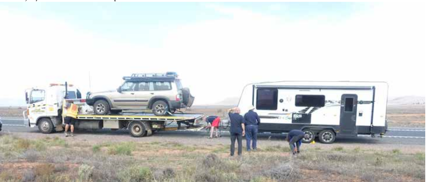
Clutch problem brought the Riddles to a halt but luckily RAA help was only 10 minutes away