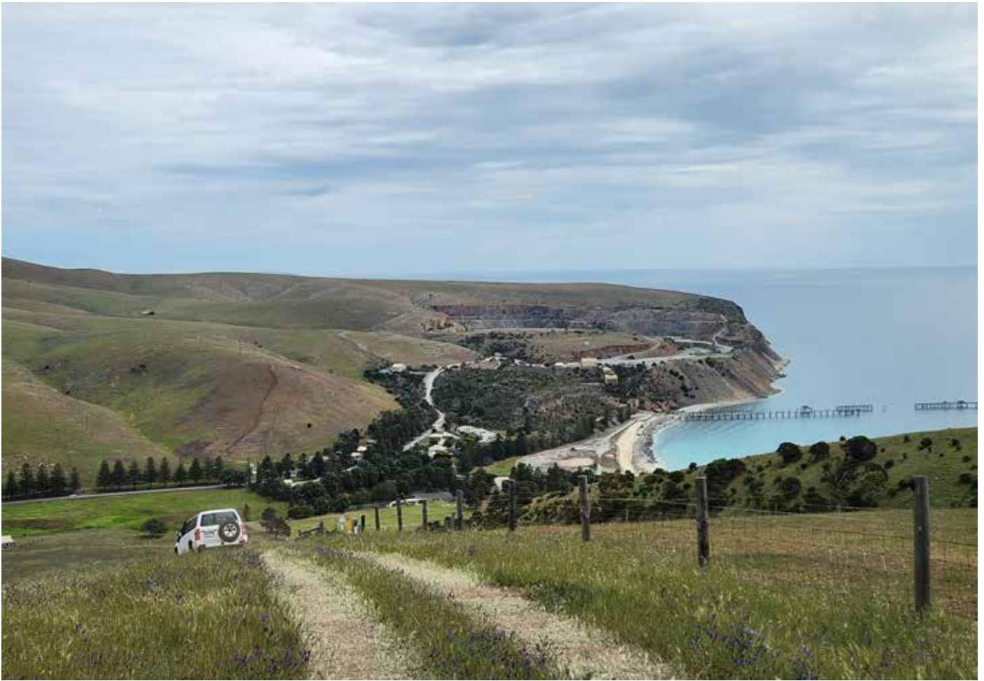
Rapid Bay from the coastal track, above, while fellow travellers share the experience, below