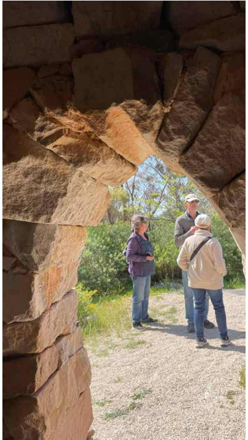
Historic buildings at the Seven Hills Winery