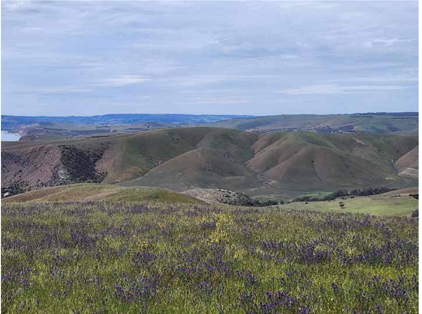
Where the hills of the Fleurieu Peninsula meet Gulf St Vincent