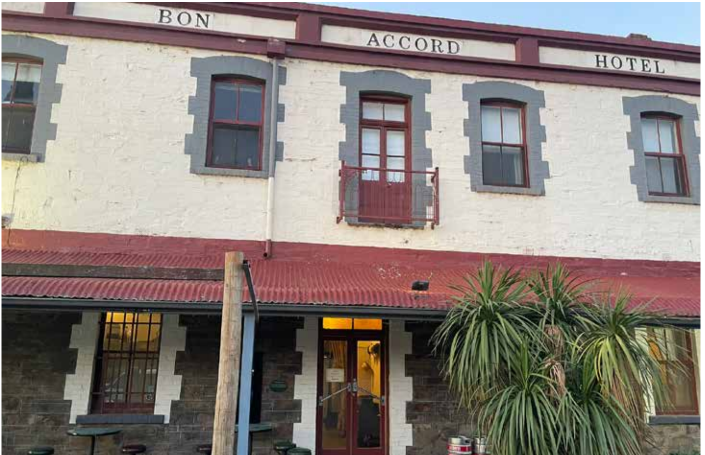
The historic Bon Accord Hotel in north Burra was built in 1874 and it originally provided stabling for horse and trap while below another shot of the cliffs along Baldina Creek