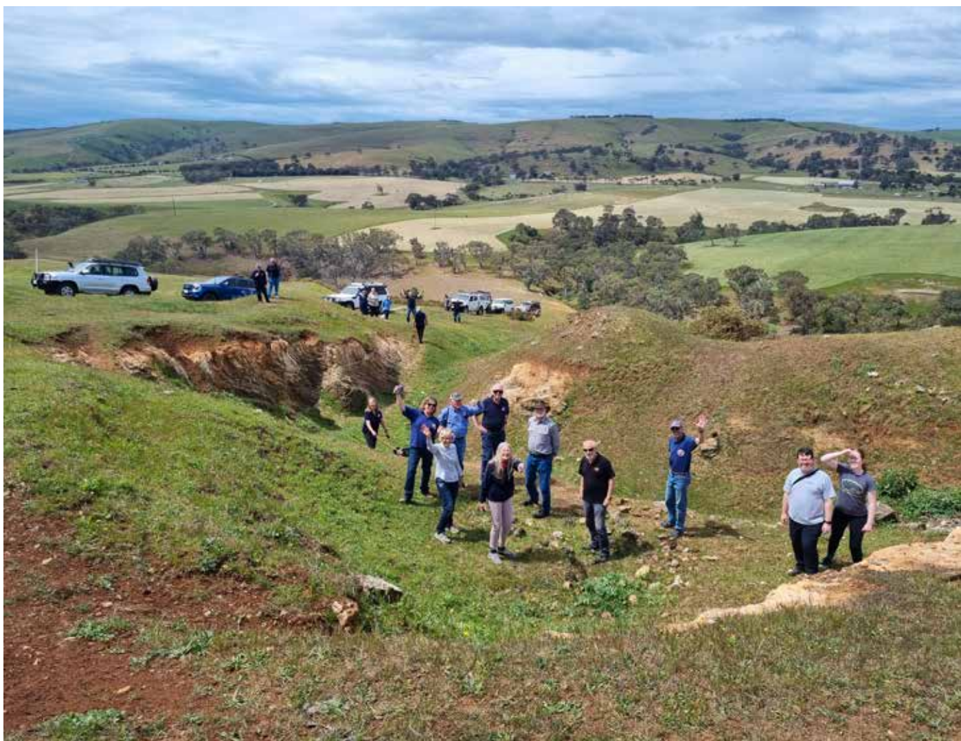
An old gold mine site near the ruins of the miner's cottage. Below, the gang's all here

Had to be mindful of a herd of cows blocking the road. Apparently, there was 1 bull in the mob who looked very happy! Quite a few calves around.