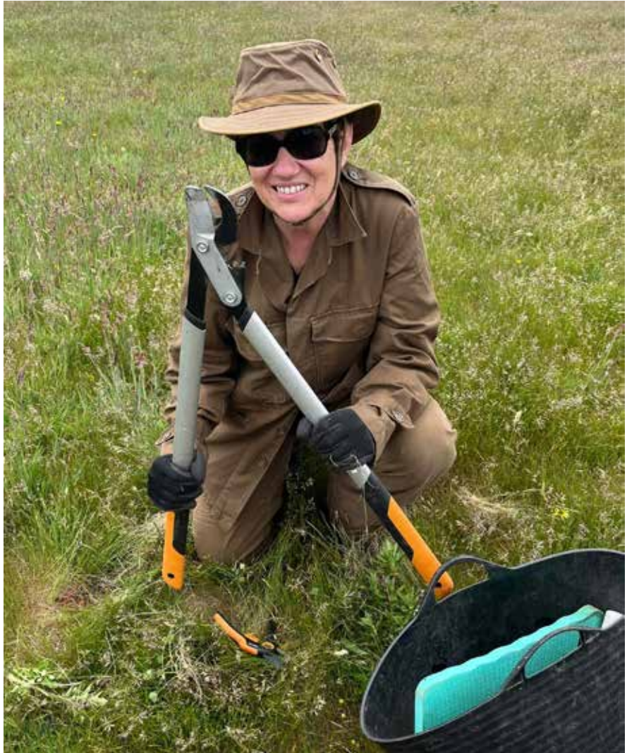
The working party gets down to business. Our task was to help eradicate the Apple of Sodom and Cotton Bush.

Our task for this weekend was to help eradicate the Apple of Sodom and Cotton Bush within the revegetated area. Most of