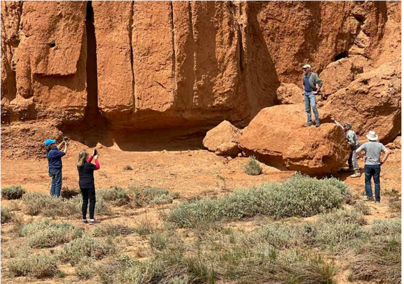
The magnificent deep red alluvial cliffs along Baldina Creek with unique fossil deposits of megafauna.