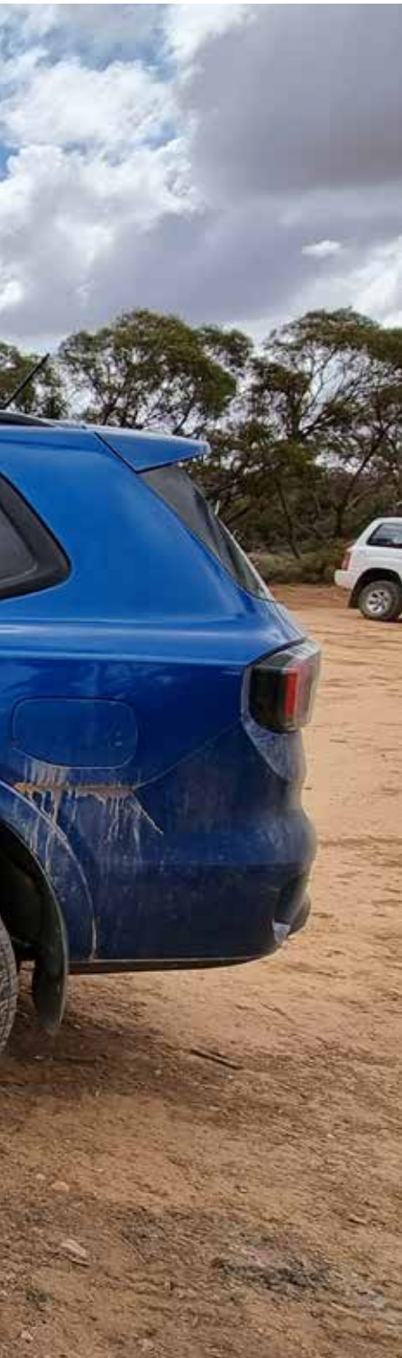
Equal Second Prize: “Oh no another RAA holiday”,